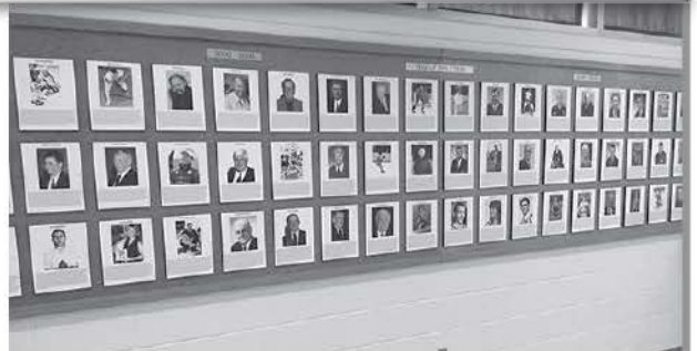
NBSHF Members Plaque Wall at Memorial Gardens